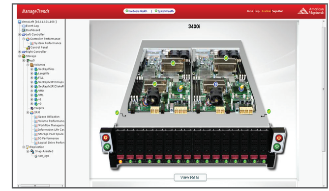
Simplifying Management with ManageTrends